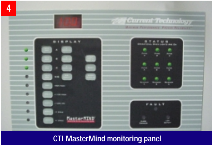
CTI MasterMind monitoring panel

client wishes us to perform the testing and prepare a test report.