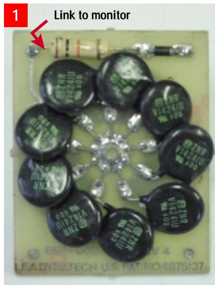
1 Link to monitor

Virtually every SPD unit has indicator lights. In most cases, the lights are green, and when a failure occurs, they go out. This alerts the user that the unit needs service or replacement. Beyond the three lights, how each SPD vendor designs their monitoring differs greatly. For example, one SPD manufacturer uses eight 130 volt MOVs (on a 120 volt system). These MOVs are not connected to the monitoring circuit. A ninth, 150 volt MOV is connected to the monitoring circuit. It is very possible (and likely) that the eight 130 volt MOVs will fail first, due to their lower clamping voltage, while the 150 volt MOV,